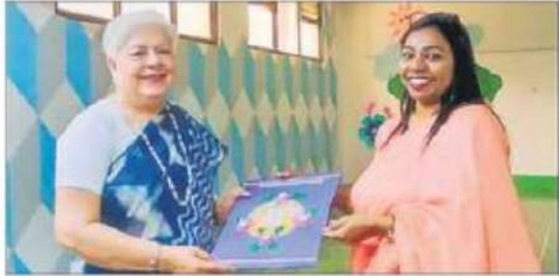
Principal of Mount Carmel school felicitating the resource person.