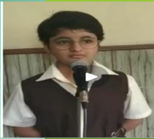
SPEECH ON WORLD ENVIRONMENT DAY