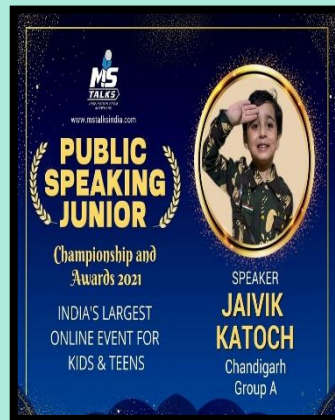
JAIVIK Participated as a speaker and secured place among Top 5 speakers.